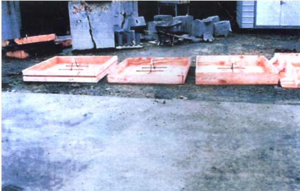
Photo 1. Forms before concrete placement