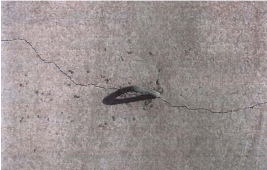
Photo 5. Typical tensile failure in concrete which caused a vertical crack