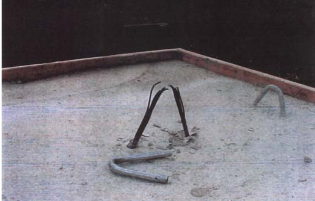
Photo 6. Pulling iron strand failure