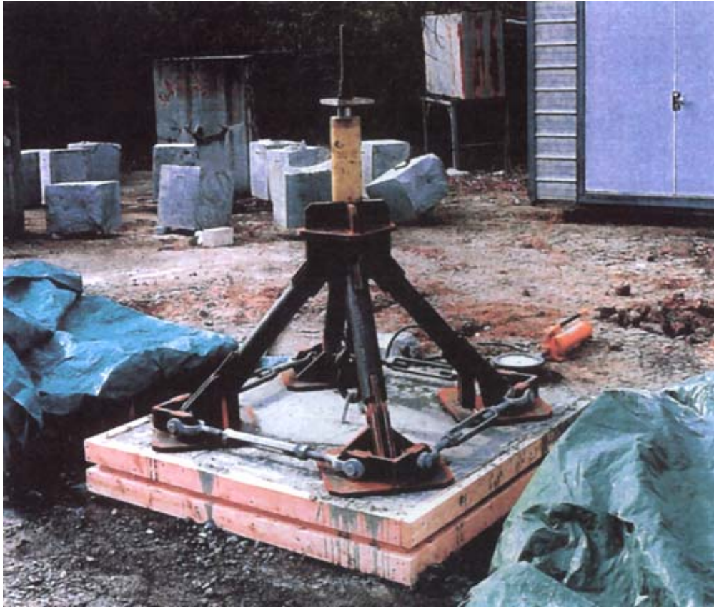
Photo 4. Load frame, ram, and jack