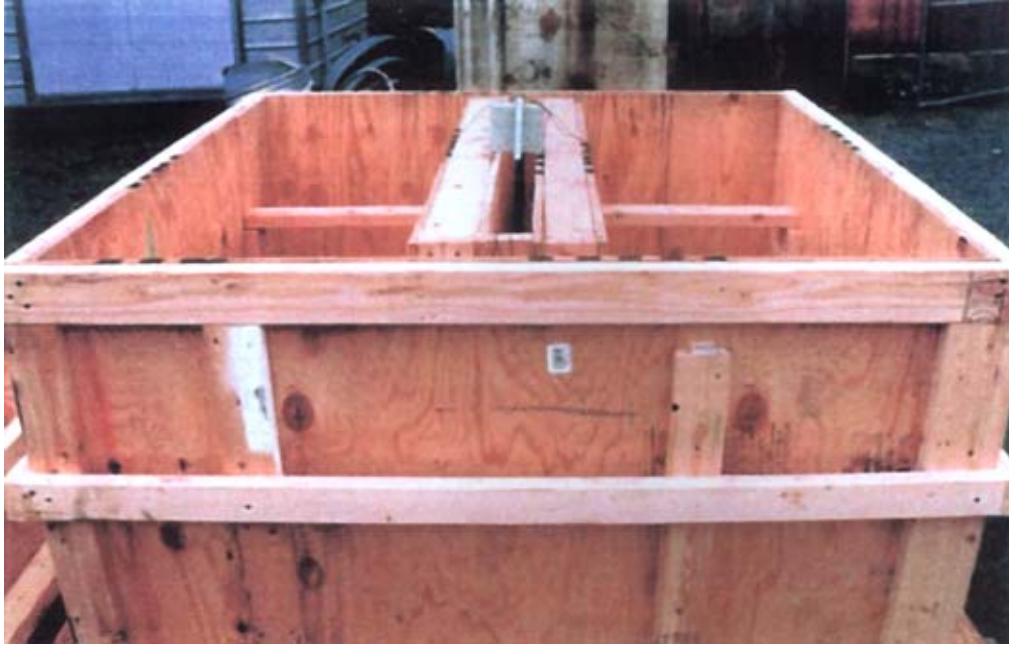
Photo 1. The 44" pulling iron for septic tank. Note block out in form that caused the pulling iron to be embedded in 3" thick wall of concrete.